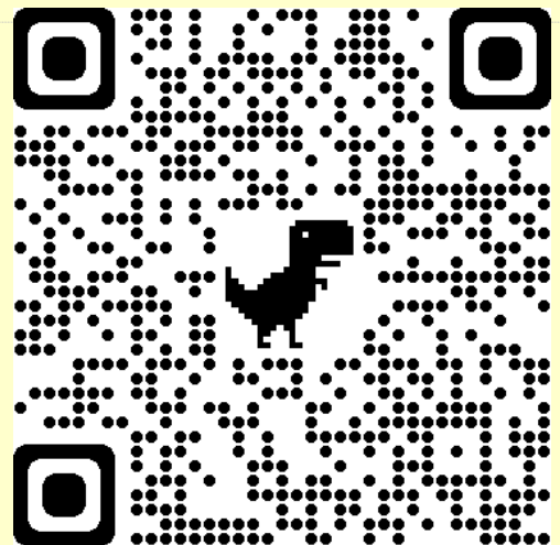
Boaz High School on Twitter